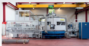
Revolving transfer machine