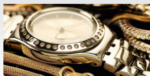
Jewelry-, tin and plastic processing